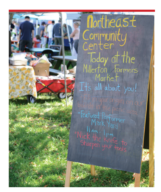
NECC sponsors the Millerton Farmers Market which runs yearround in the village, weekly Memorial Day through October and bi-weekly during the Winter. The market focuses on local and organic food and products.

Purchased 8,000 pounds of fruit and vegetables, 560 dozen eggs and 280 gallons of milk from local farms to distribute to four area food pantries.